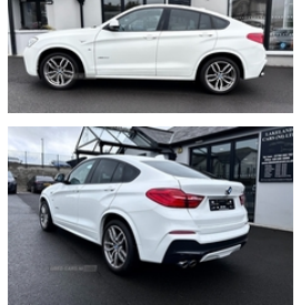
Absolutely Immaculate Example!

Comes complete with Full Service History, Full Owners Manuals, 2 Keys, Heads Up Display, Full black leather, Heated, Electric Seats, Sat Nav, & all the usual MSport refinements.