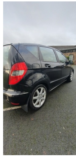
2012 Mercedes A180 CDI 5 Door Avantgarde in Immaculate condition. Mot valid until until Dec 2024. This very economical wee car comes with;

Upgraded 17" Mercedes Alloy Wheels Mercedes Digital Service History Front & Rear Fog Lights Recently Serviced Sports Package Half Leather Seats Auto Door Lock Electric Mirrors