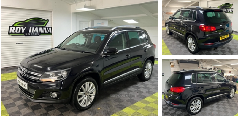
A truly beautiful 2012 Volkswagen Tiguan Tech Sport ready for viewing at Roy Hanna Motors!

FULLY SERVICED - 2 KEYS - BLUETOOTH - TINTED WINDOWS!