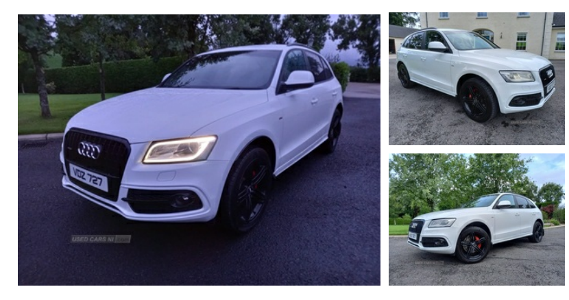
Immaculate Audi Q5 2.0L TDI Quattro S Line Plus, 5 door, S Tronic BLACK EDITION

Genuine reason for sale. Reg not included.