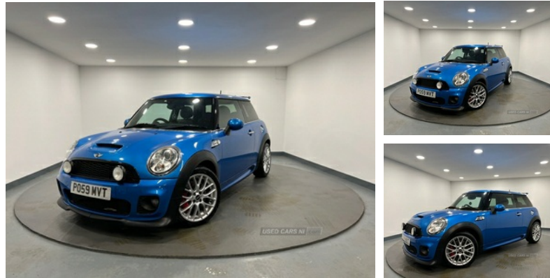
2010 Mini Hatch John cooper works 1.6 208 BHP

Car has just covered 95,000 warranted miles with Full service history & 2 keys present,