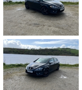
Good condition for year MOT Jan 2025