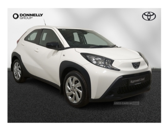
Toyota Aygo X 1.0 VVT-i Pure 5dr Auto