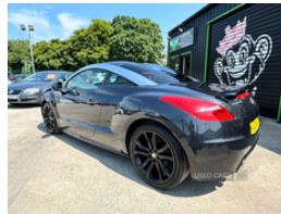
2012 Peugeot RCZ 1.6 THP GT 2dr